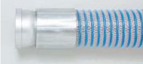
Example of Metal Fixture Fitting